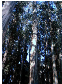
California Bay Umbellularia californica