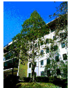
Douglas-fir Pseudotsuga menziesii