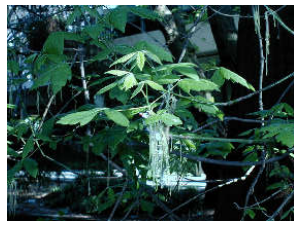
Oriental Flowering Cherry Prunus serrulata